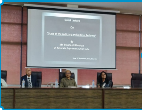
Sr. Adv. Prashant Bhushan, Supreme Court of India in a guest session on "State of the Judiciary & Judicial Reforms"