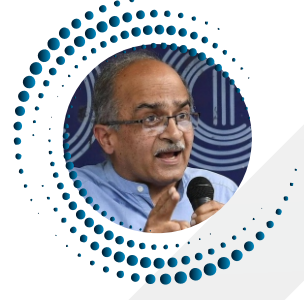
Sr. Adv. Prashant Bhushan Supreme Court of India