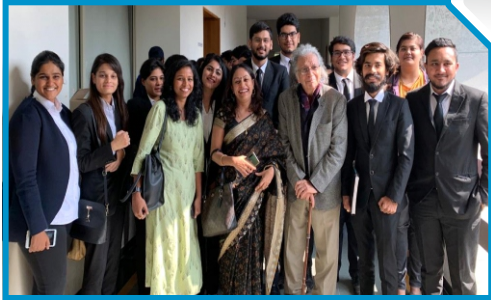
Visit to Nirma University to attend expert session by Shri Upendra Baxi