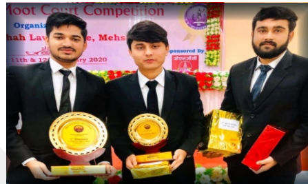
1 st runners up S.M. Shah Moot Court Competition at Mehsana, 2020