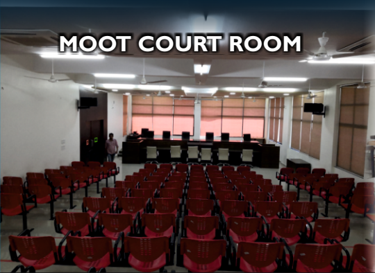
MOOT COURT ROOM

The campus is fully internet-enabled, each classroom has a/c, projector, microphone, web cam & facility for simultaneous online & offline lectures, library is equipped with legal resources & softwares with access to national and international books & journals, studio, computer lab and a lush green lawn for students to relax in, a canteen, sports ground and much more.