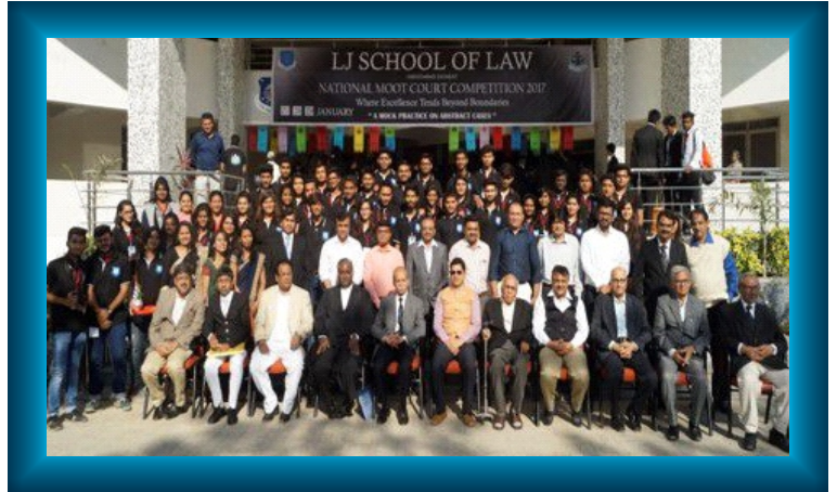
First National Moot Court Competition-2017