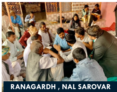
RANAGARDH , NAL SAROVAR