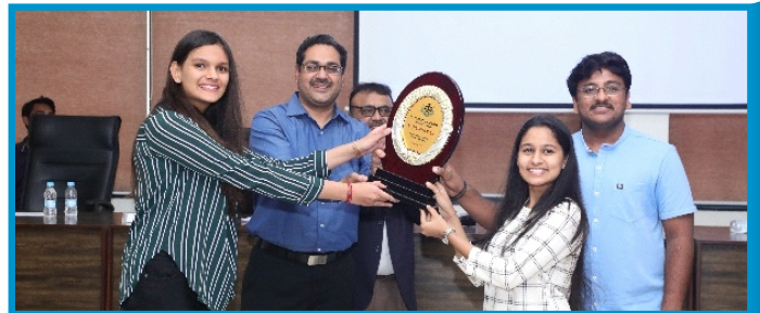
National Parliamentary Debate Competition