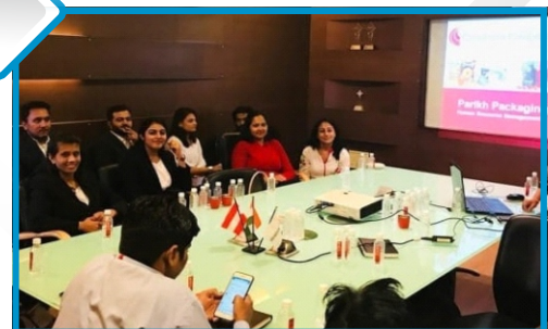
Parikh Packaging Factory, Sanand