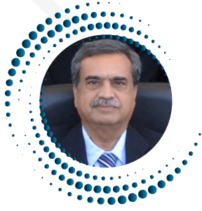
Hon'able Justice Mr. M.R. Shah, Justice of supreme court of India