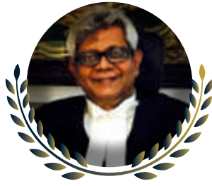
ADV. S.V. RAJU Additional Solicitor General, Supreme Court of India