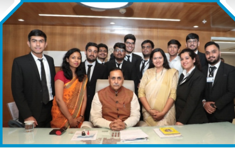
Gujarat Vidhansabha, Gandhinagar, meeting with Chief Minister, Gujarat Shri Vijay Rupani