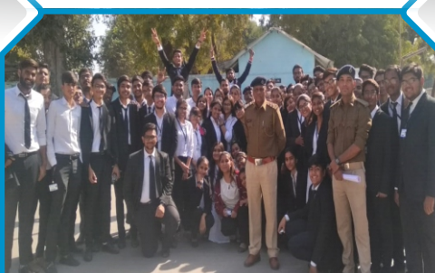
2 nd Visit to Central Jail, Sabarmati, Ahmedabad