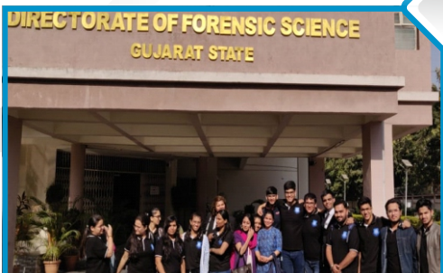
Visit to Forensic Lab, Gandhinagar