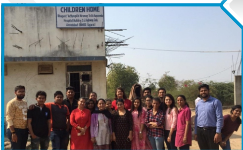
Visit to Children's Home, Sola, Ahmedabad