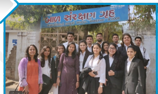
Juvenile Home, Khanpur, Ahmedabad