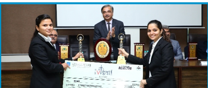
National Client Counselling Competition