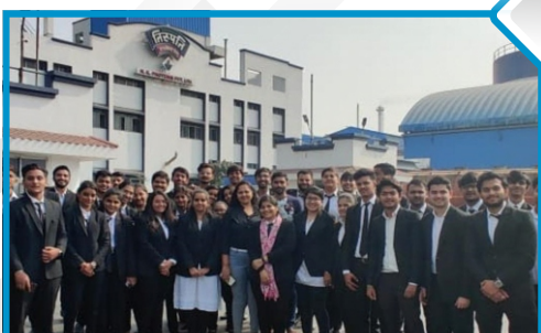
N K Protein Factory, Thol, Ahmedabad