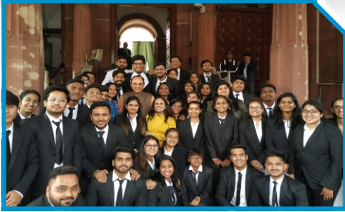
3 days Delhi visit, Visit to Lok Sabha and Rajyasabha Meeting with Mr. Subramaniam Swamy, Member of Parliament