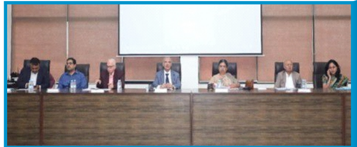
Vidhvata-I, January, 2019