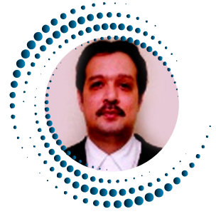
Hon'able Justice Mr. J.B. Pardiwala Justice of Gujarat High court