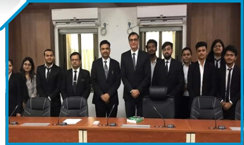
Visit to Mediation centre, Gujarat High Court