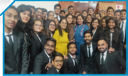
3 day Delhi Visit, Lok Sabha and Rajyasabha Meeting with Ms. Smriti Irani, Union Textile Minister