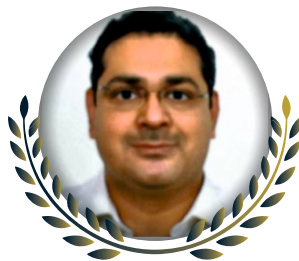
ADV. ANIRRUDH MAYEE Advocate, Supreme Court of India, Ex-Govt. Pleader