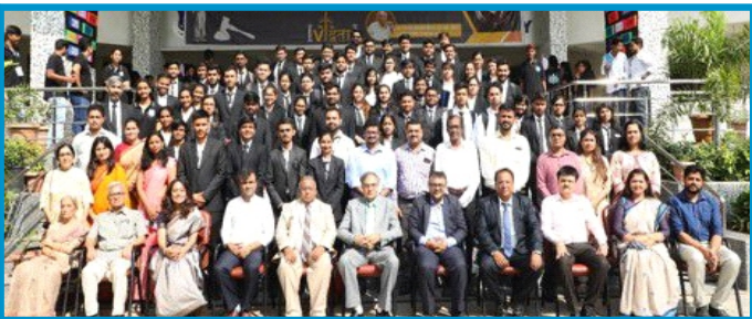
Vidhvata-II, September, 2019