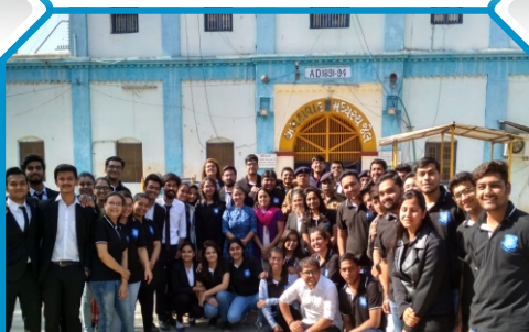
Central Jail, Sabarmati, Ahmedabad