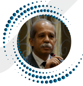
Hon'able Justice Mr. Akil Kureshi Justice of Gujarat High court