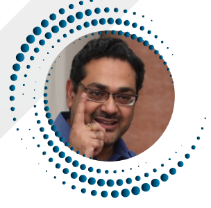
Adv. Aniruddh Mayee Supreme Court of India