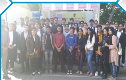
Visit to District Legal Service Authority Camp, Kankaria, Ahmedabad