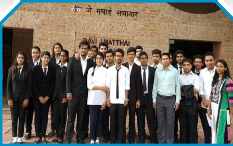
Visit to IIM, Ahmedabad