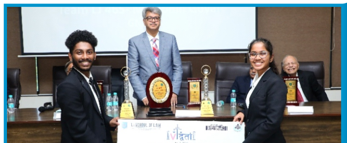
National Quiz Competition