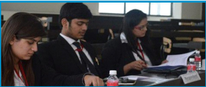
Second National Moot Court Competition 2018