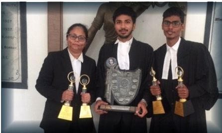
Winner of Inter Law Collegiate Moot Court Competition held at Late Shri I M Nanavati, 2020